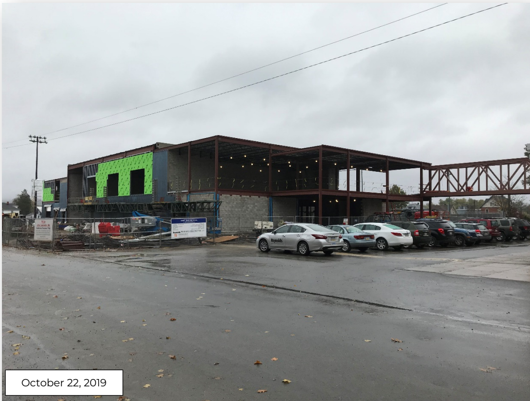
Phase 1 (New Gym Addition) Northwest View