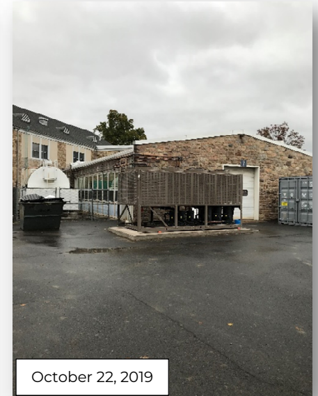
Phase 1 (New Gym Addition) Northwest View of EFIS Repair at Shop Room A116