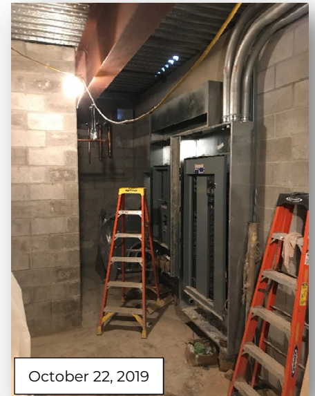
Phase 1 (New Gym Addition) East View in Lobby D101 Towards Main Entrance