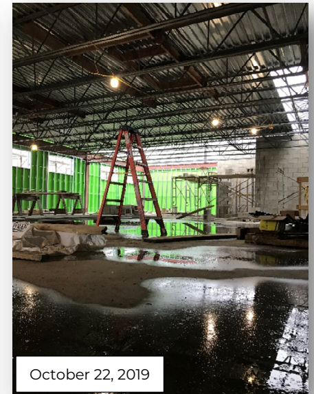
Phase 1 (New Gym Addition) South View of 1 st Floor Weight Room D111